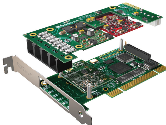
A200 4-Port FXO/FXS, shown with Hardware Echo Canceller, disassembled.

Like all the cards in the award-winning Sangoma AFT Series Product Line, the A200 and Remora™ system's architecture is shared with Sangoma's A101, A102, A104, and A108 cards, ensuring common 3.3 V or 5 V, high performance, universal PCI or PCI Express compatibility, and crash-proof field